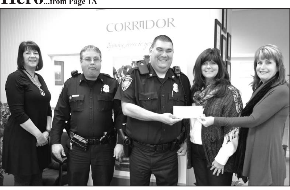
Corridor Mortgage also donated to the Blairsville Police Department's Shop With A Cop program, which took kids shopping on Saturday, Dec. 10

benefits, this year on Monday, Dec. 12: one to the newly christened Shop With A Hero program out of Towns County, and the other to the Blairsville Police Department for their Shop With A Cop program.